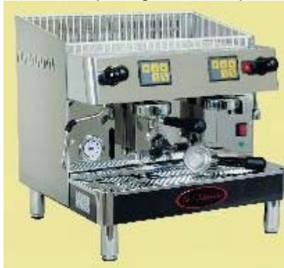
La Vittoria Compact 2 Group machine (1 and 3 group machines also available)

While we don't lease equipment to businesses, we do offer our customers large discounts on Bunn and Fetco brewing products. We also are an Arizona distributor for La Marzocco, Franke, and Falcon Grimac Espresso machines and equipment and are able to offer great prices to our wholesale customers. We will be happy to assist you in determining your needs and quoting some low prices for you.